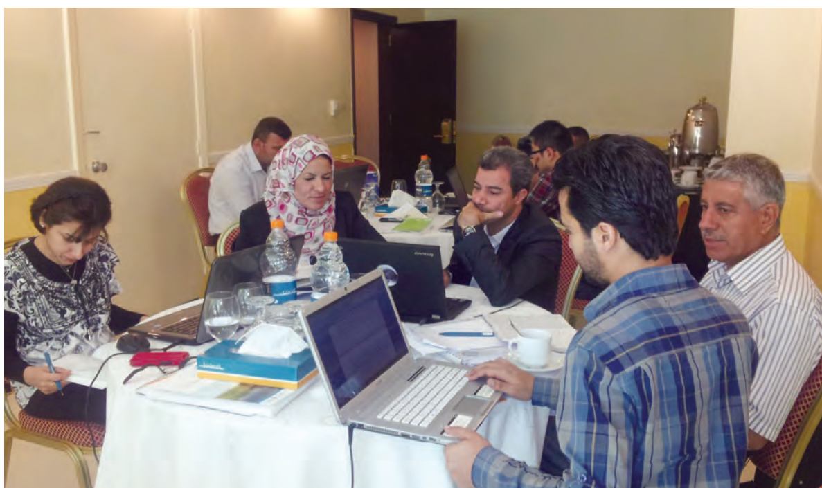
The nature team at work, training workshop, Amman, August 2013

In September, the whole culture team met in Baghdad with its mentor to review progress in writing, and to ensure that there was no overlap between information provided for each