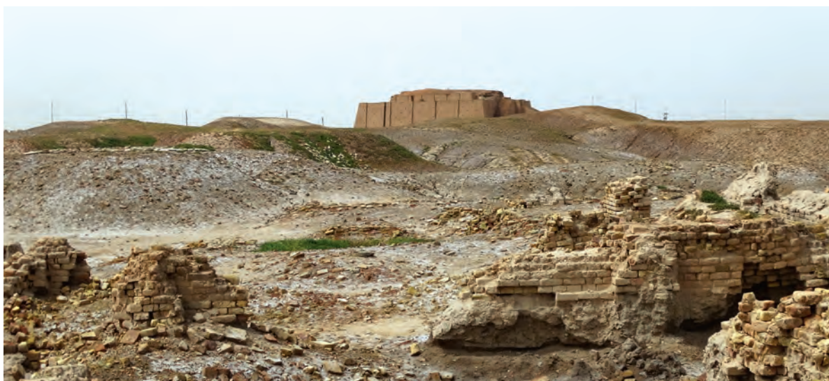
The Ur site and ziggurat, 2014 © Geraldine Chatelard.