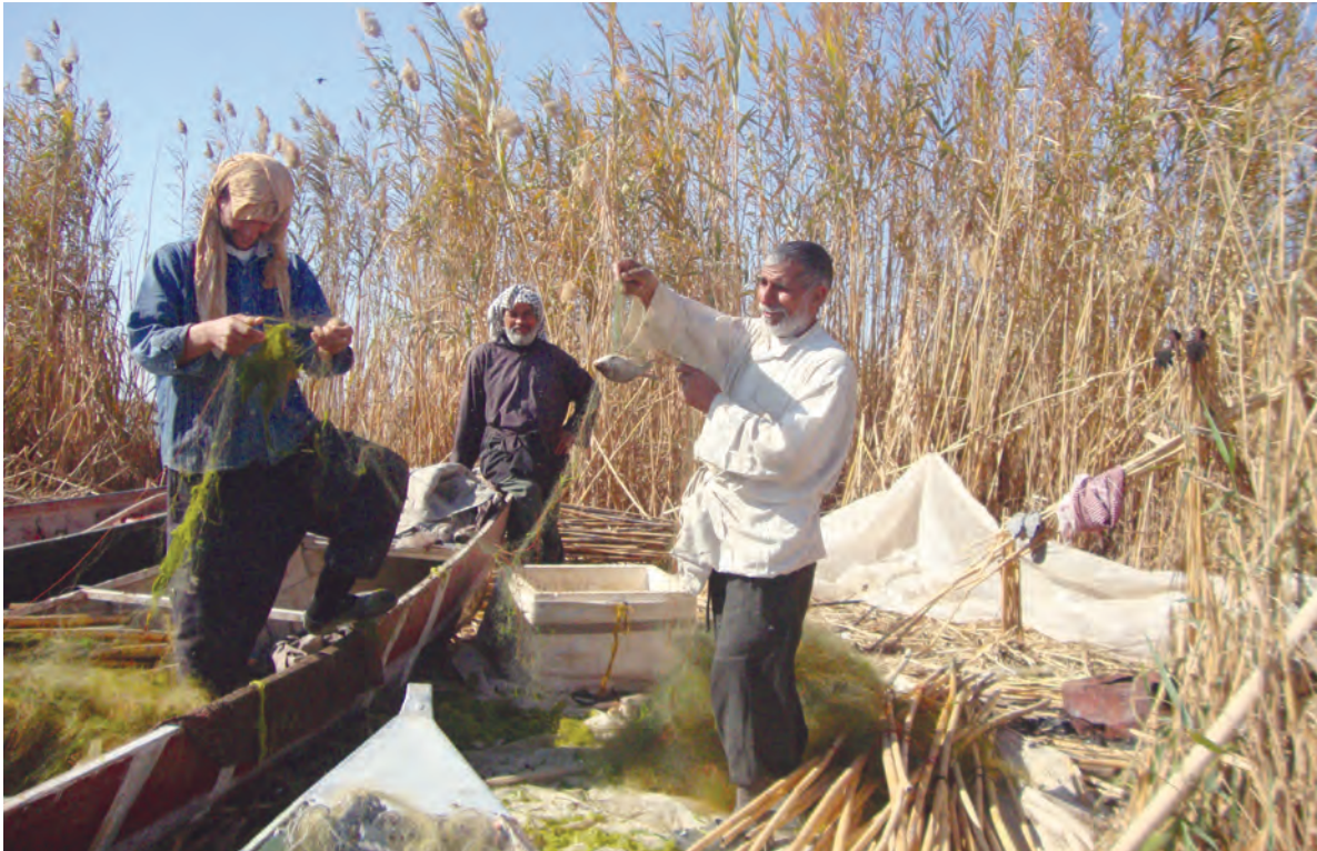
Fishermen of the marshes