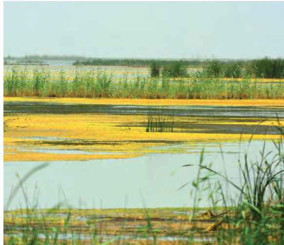
Landscape of the West Hammar Marshes