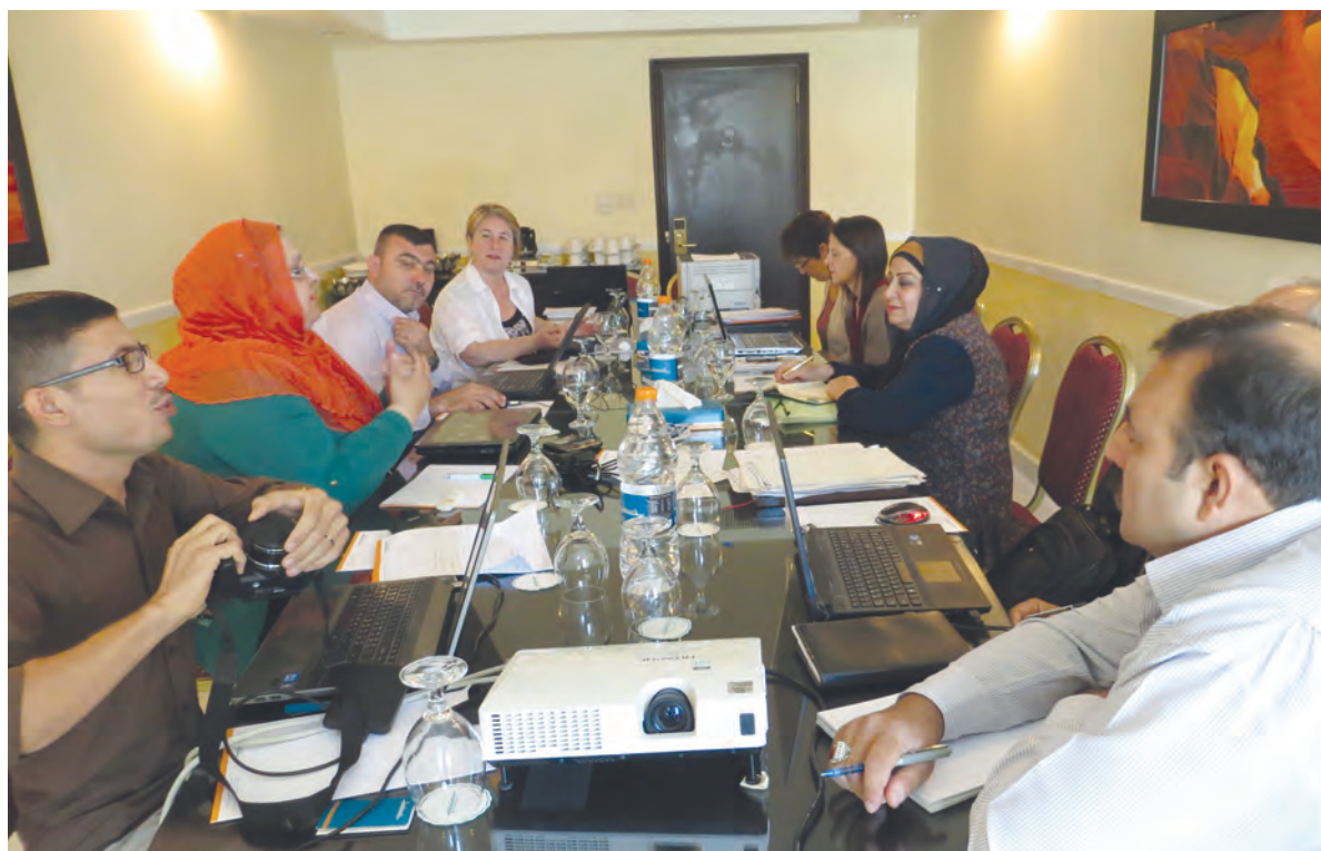
Consolidation workshop, Amman, December 2013

The relevance of presenting the property under criterion (v) was also thoroughly debated during the workshop. The culture team focal point was convinced that only under this criterion could an argument be built to include in a single nomination Mesopotamian sites located in the historical marshes, and the natural attributes of the contemporary Marshlands. By contrast, the nature team feared that this criterion would lead to the site being categorized as a cultural landscape, and might jeopardize the chances of the property being inscribed under natural criteria.