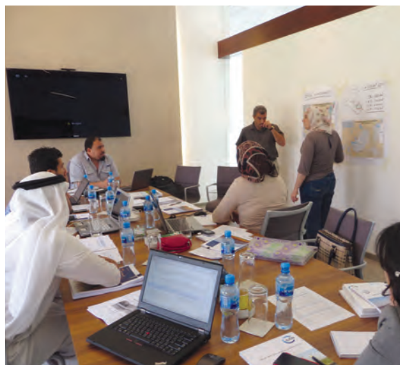
Sketching the boundaries of the property, training workshop, ARC-WH, June 2013

In the following week, the mentors performed a final round of proofreading, and the focal points finalized the layout of the text, tables, maps and photos. The Steering Committee Chair reviewed the final product and gave his go-ahead for printing. On 23 January, a signature ceremony was subsequently held in Baghdad in which the Minister of Environment and Minister of Tourism and Antiquities officially endorsed the dossier after reading its Arabic version. It was then time to make logistical arrangements to submit the document to the WHC a few days ahead of the 31 January deadline. The dossier was later accepted as completed.