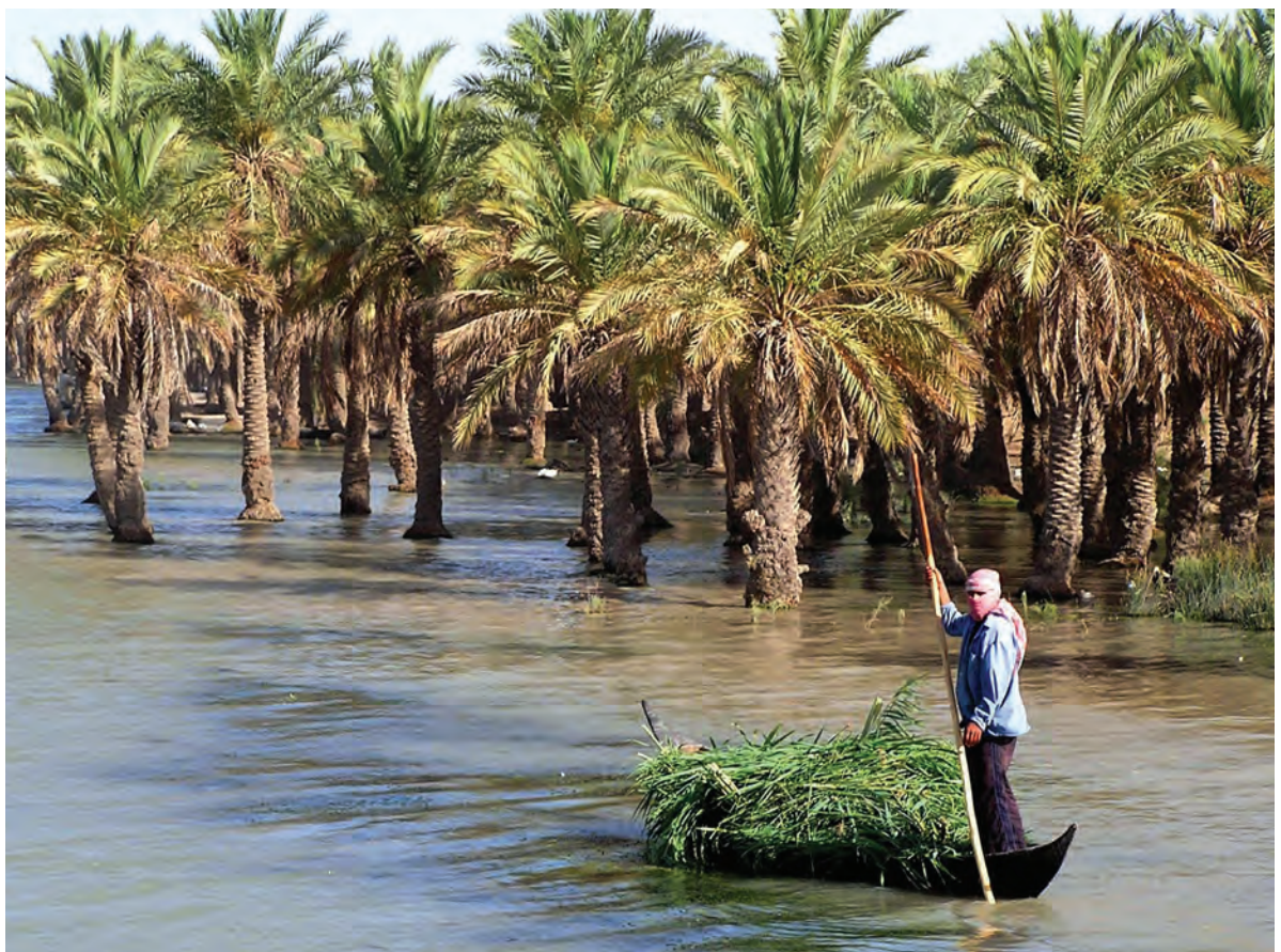
Flooded margins of the central marshes

(x) To contain the most important and significant natural habitats for in-situ conservation of biological diversity, including those containing threatened species of outstanding universal value from the point of view of science or conservation.