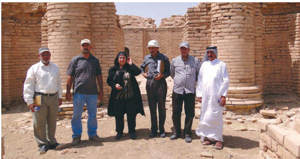
Field visit of the nature team to the site of Uruk, August 2013

The workshop was of critical importance as it was the event when the final touches were made on the core arguments for the property in terms of values, OUV statement, the linkages between the natural and cultural components, the integrity and authenticity statements, as well as the management arrangements. Further, the final maps for the boundaries of the property were produced, incorporating all key attributes and information collated by the two teams during their home-base preparations. The presence of the advisers was instrumental in fine-tuning the document in accordance with World Heritage guidelines and best practices. Experts also provided invaluable contributions on the comparative analysis in addition to the authentication of the various arguments made for the value of the cultural and natural attributes.