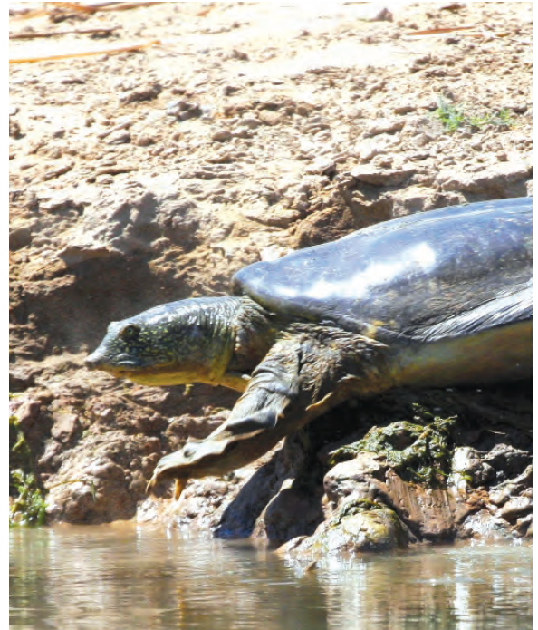
Soft-shelled turtle, a threatened species