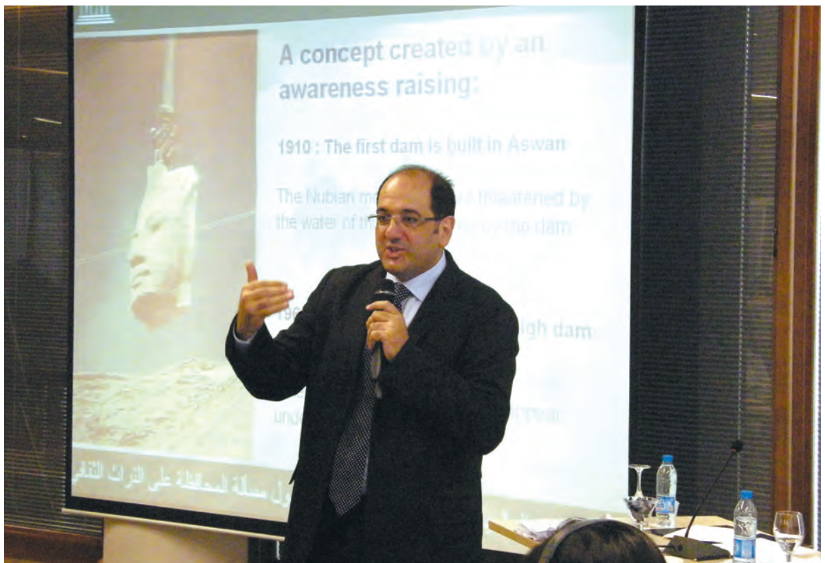
First induction training workshop, Amman, June 2009