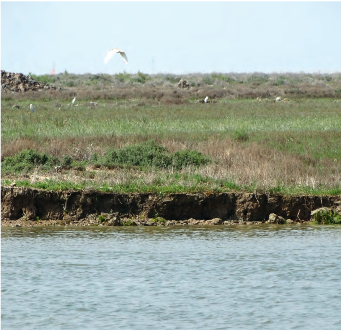
East Hammar Marshes, 2014