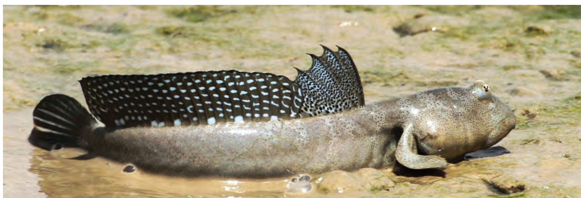
Mudskipper, a subtidal fish