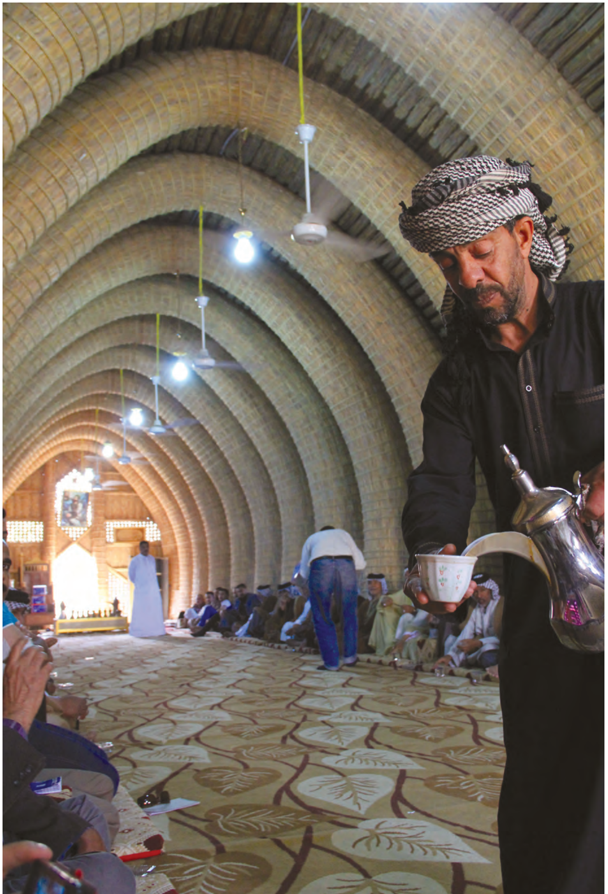
Al Madheif (guest house made of reeds)