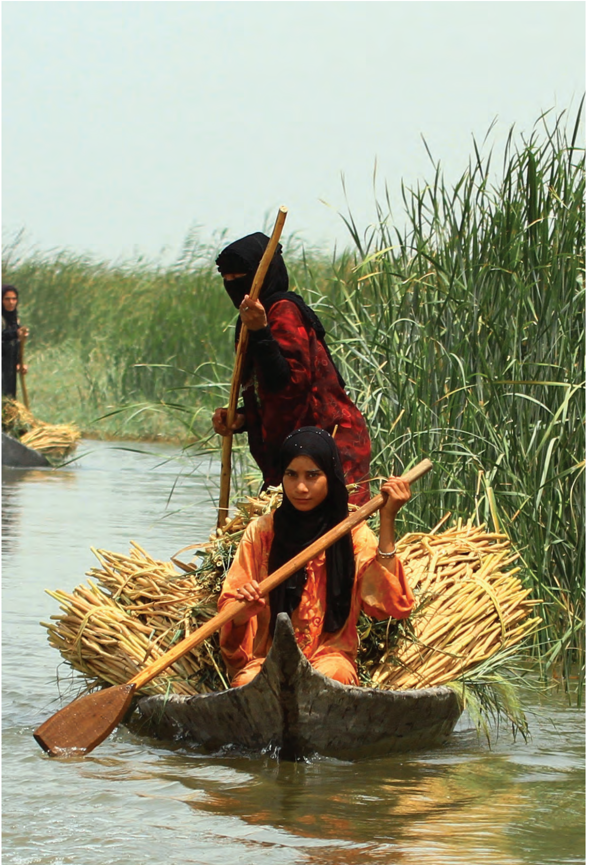
The Lower Mesopotamian Marshes