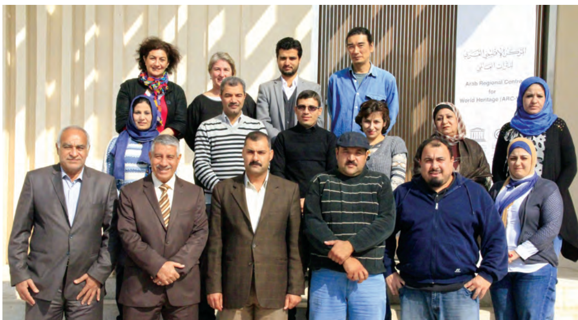
The two teams, their mentors and some trainers at the consolidation workshop, ARC-WH, December 2013

The workshop was of critical importance as it was the event when the final touches were made on the core arguments for the property in terms of values, OUV statement, the linkages between the natural and cultural components, the integrity and authenticity statements, as well as the management arrangements. Further, the final maps for the boundaries of the property were produced, incorporating all key attributes and information collated by the two teams during their home-base preparations. The presence of the advisers was instrumental in fine-tuning the document in accordance with World Heritage guidelines and best practices. Experts also provided invaluable contributions on the comparative analysis in addition to the authentication of the various arguments made for the value of the cultural and natural attributes.