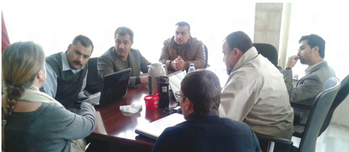
Finalization workshop, Amman, January 2014