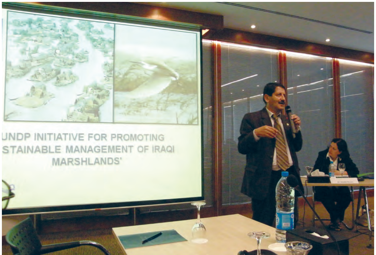
Kick-off meeting, Amman, June 2009