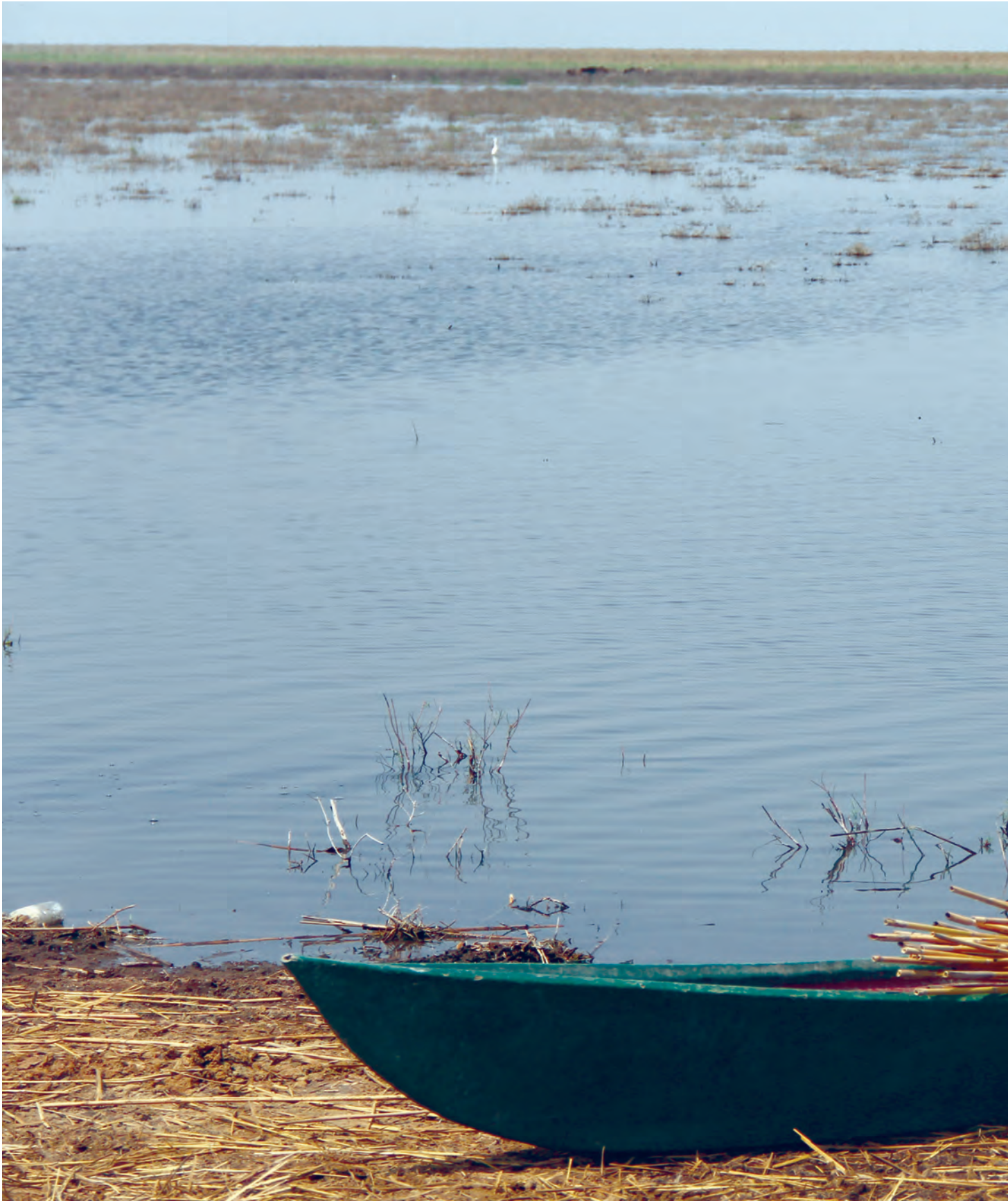
Central Marshes (Jshabeish)