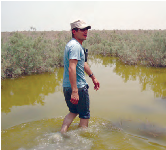
Surveying the cultural sites in the Marshlands, 2011

sites covering the region between Rumayla to the west and West Qurna to the east, 11 both delivered in late 2011. However, no study envisioning the Ahwar as a living cultural landscape, nor an inventory of the intangible cultural heritage, were carried out as part of the dossier preparation.