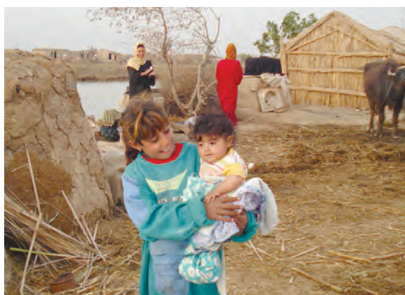
Village in the marshes

It was therefore agreed that the Tentative List submission did not reflect the current status of the Marshlands. Since the time when the Government of Iraq had placed the property on its Tentative List, change had happened in the Marshlands allowing for a partial, but nonetheless highly significant hydrological restoration closely monitored through a host of international projects (see Section 1.2). However, less was publicly known about ecosystem recovery, a reality that raised the question of the documentation available to support the World Heritage case of the Marshlands. Most of the efforts to assess the impacts of the re-flooding had been undertaken by Nature Iraq as part of the national programme addressing the KBA. The programme included numerous field visits to the various components of the Ahwar by national and international experts and specialists from the various fields of ecology. Although not fully systematic or detailed, the research associated with the