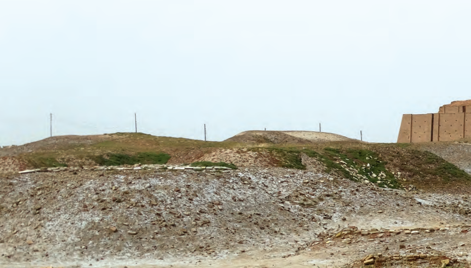
Ur and Ziggurat © Géraldine Chatelard