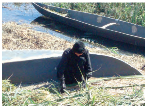
Women of the marshes sorting out reeds