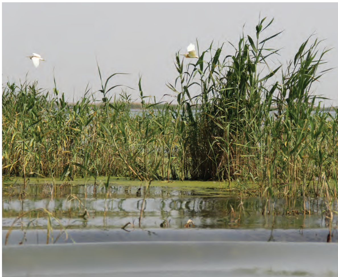
Reeds of the Marshlands

Tobias Garstecki, biodiversity expert and trainer of the natural heritage team