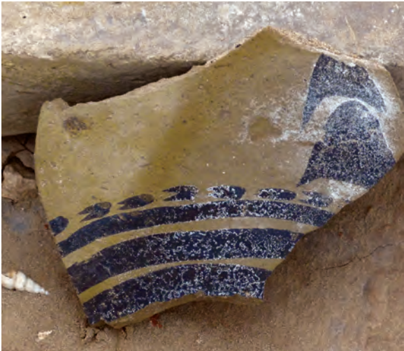
Ubaid pottery and freshwater shells, Eridu, 2014