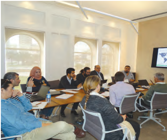
Consolidation workshop, ARC-WH, December 2013

This milestone step was concluded with the production of a semi-final draft of the dossier and a decision by the Steering Committee Head to convene a final round of teamwork before the submission of the dossier to the WHC. This was mostly to allow the culture team to integrate a final set of information relating to criterion (v) and harmonize their information with those pertaining to the natural components.