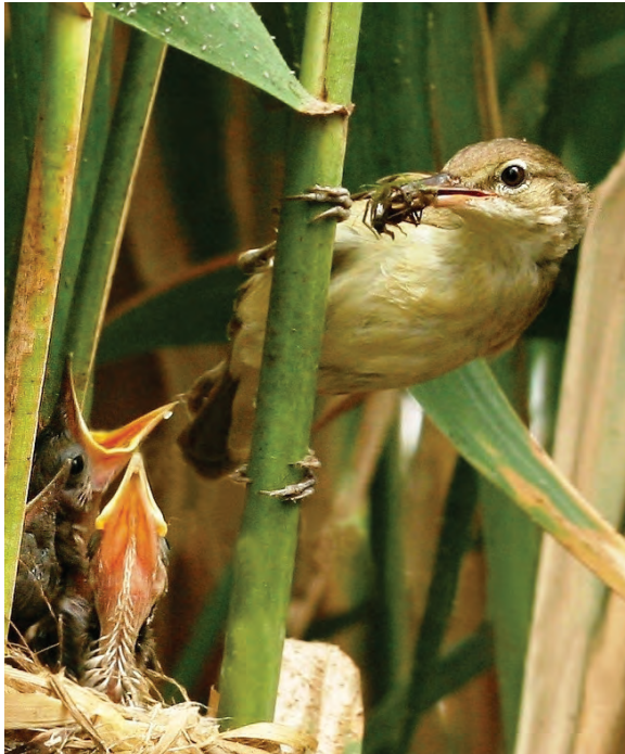
Basra Reed Warbler, endangered species