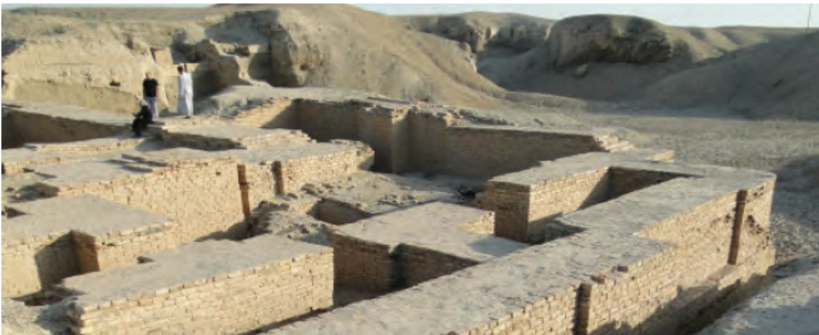
Field visit of the nature team to the site of Ur, August 2013

Each day of the workshop was dedicated to one section of the dossier, opening with a plenary session where all team members agreed on fundamentals. The teams were then split into small working groups each under the supervision of two advisers and, if necessary, with the assistance of a translator. Each group, comprising members of the nature and culture teams, worked on merging the two parts of the same section. As soon as a section was finalized in Arabic, the mentors introduced the changes in the English text so as to arrive at two consistent language versions of each section by the end of the day. Through this series of intensive sessions, a near final version of the consolidated dossier was achieved. It also appeared that some information and documentation was missing mostly in the non-narrative sections of the dossier, such as lists of institutions or contact information.