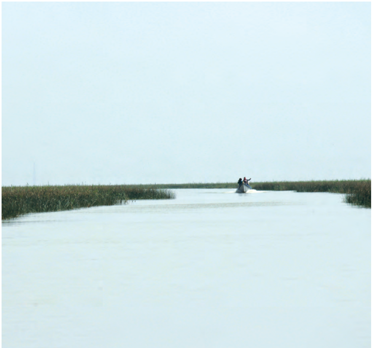
Landscape of the Iraqi Marshlands