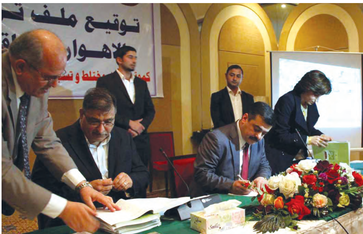
Signature ceremony of the nomination dossier by the Minister of Environment and the Minister of Tourism and Antiquities